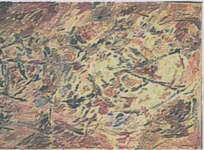
Ancestor, Oil on Canvas